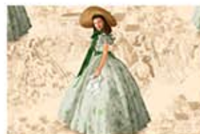
20880 AG 5 yards