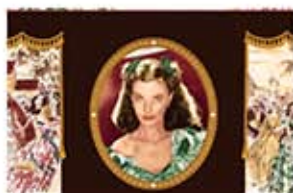
20881 A 2½ yards