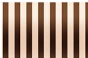
20882 AE 1½ yards