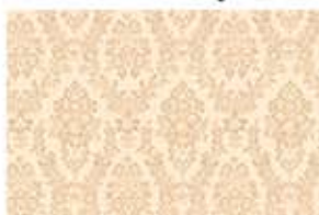
20884 E ⅓ yard