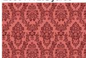
20884 C 2 yards