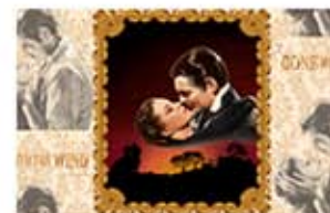
20879 A ¾ yard