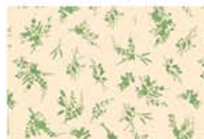
20885 EG 2 yards