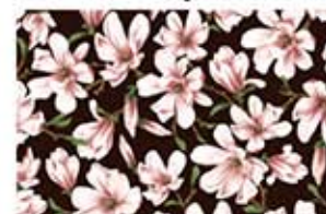
20983 A 1½ yards