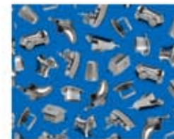
21017 B \frac{7}{8} yd