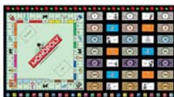
20899 J 2 panels