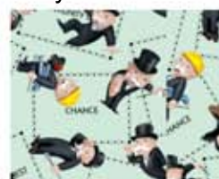
20901 Q \frac{3}{8} yd