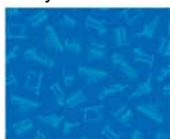
21012 B 1 \frac{1}{2} yds