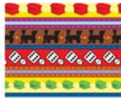
20905 S \frac{3}{4} yd