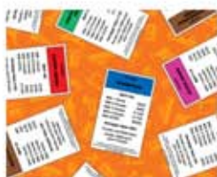
21013 O \frac{1}{4} yd