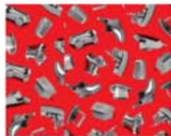
21017 R 2 \frac{3}{8} yds