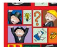
20900 R 4 yds