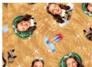
20888 A 1 yd