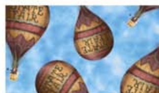
21022 B 4 yds