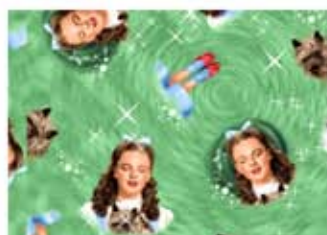
20888 G ½ yd