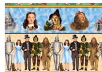
20889 B 2 yds