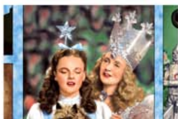
20886 B 1 panel