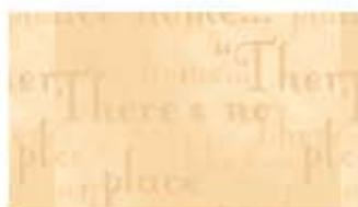
21020 E 2 yds