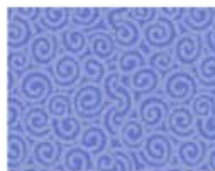
21045 Y 1 yard