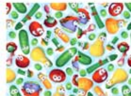
21043 B ¾ yard