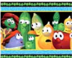
21039 B ¾ yard