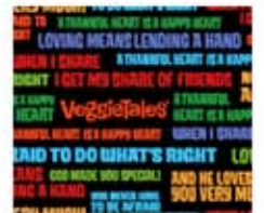
21044 J 1 ¼ yard