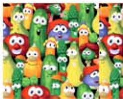
21040 G ¾ yard includes backing