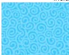
21045 B ¼ yard