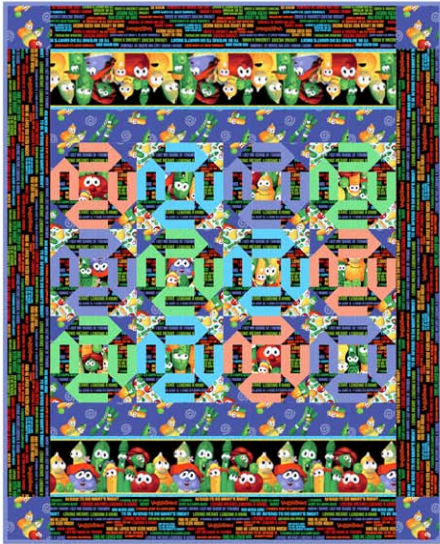
Finished size: 51" x 63"