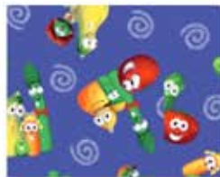
21042 Y 1 yard