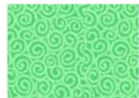
21045 G ¼ yard