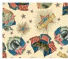
20705-E 5/8 yd.