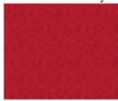
20727-R 3/8 yd.