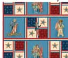
20707-NR 3 1/2 yd.