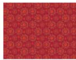
20709-R 3/8 yd.