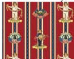
20708-R 1 5/8 yd.