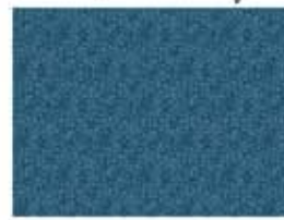
20727-N 1/2 yd.