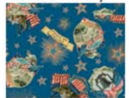
20705-N 1/4 yd.