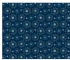
20709-N 1 yd.