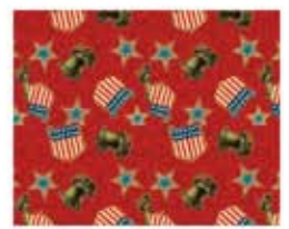
20726-R 3/8 yd.