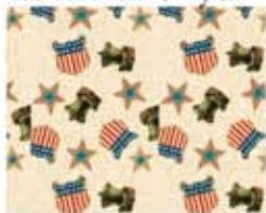
20726-E 1/8 yd.