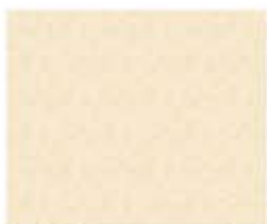
20727-E 2/3 yd.