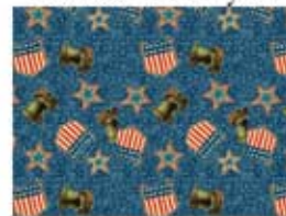
20726-N 1/8 yd.