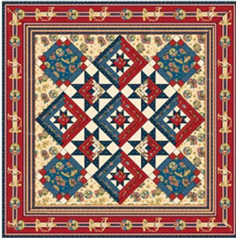
52" x 52"